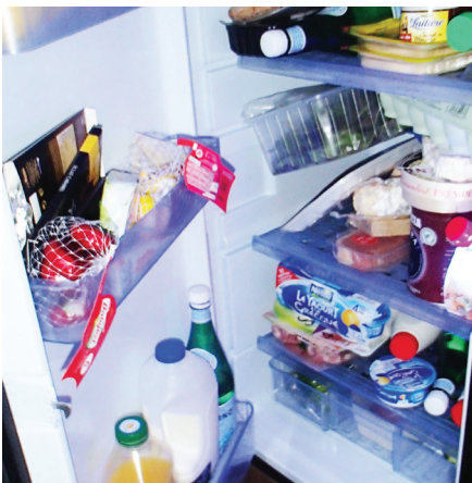
TOP LEFT You can tell a lot about a person from their fridge!

ABOVE With a bit of planning, you'll be able to make best use of your fridge while on tour