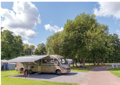
Caravan and Motorhome Club

Address Dunstan, Alnwick NE66 3TQ > campingandcaravanningclub.co.uk