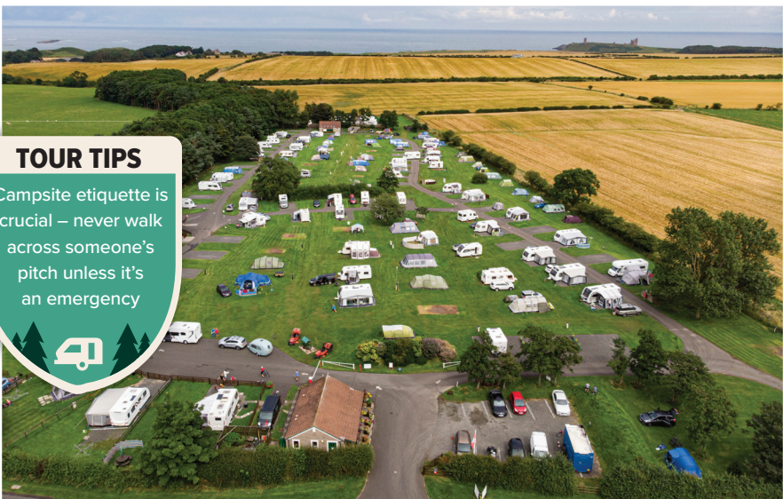
The Camping and Caravanning Club

Address Grange-over-Sands LA11 6HR > greavesfarmcaravanpark.co.uk