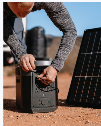
ABOVE EcoFlow's new Alternator Charger enables you to charge your devices on the move TOP RIGHT Solar panels can also be attached RIGHT Power gadgets no matter where you are