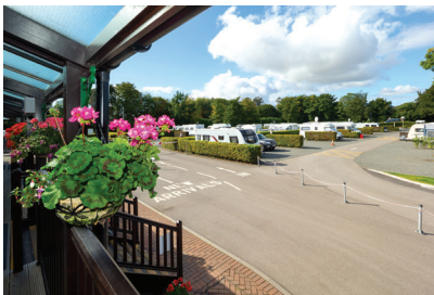
Caravan and Motorhome Club

Address Draycott Road, Cheddar, Somerset BS27 3RJ > cheddarbridge.co.uk