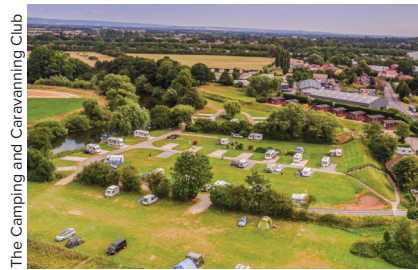
The Camping and Caravanning Club

➤ silverhillwoodlandretreats.co.uk/touring